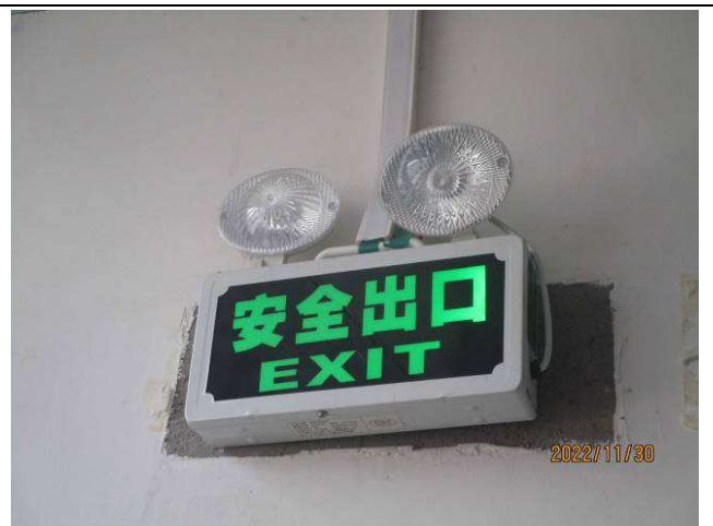
Emergency light and exit sign