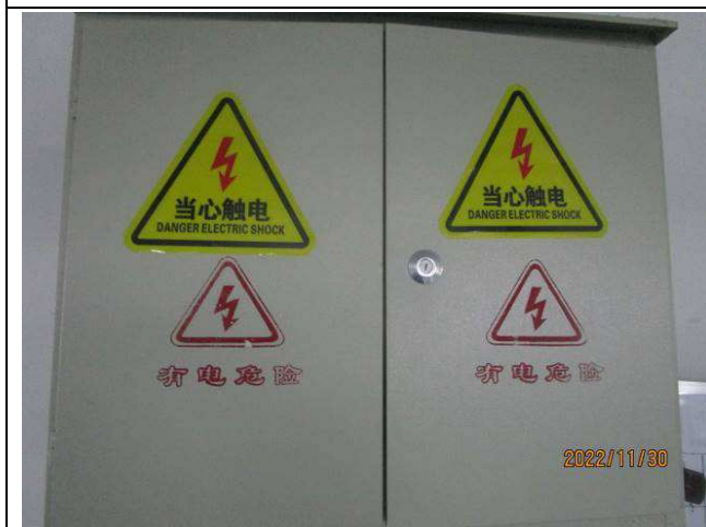
Power distribution box