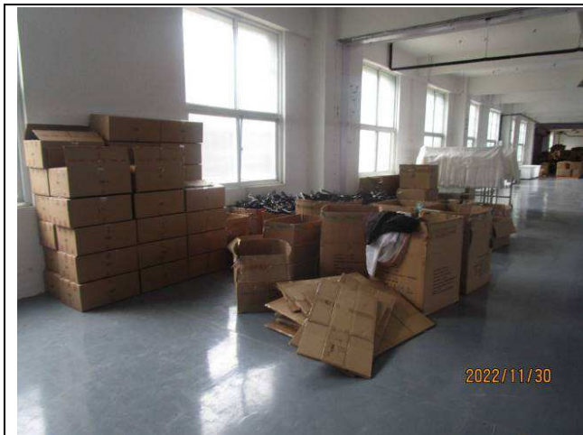
Finished products warehouse