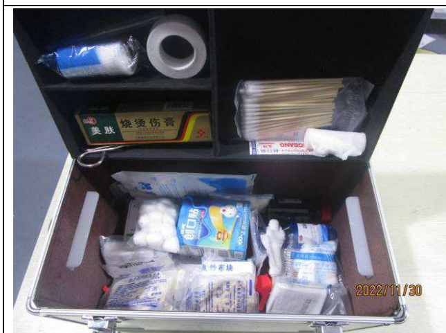
First aid kit