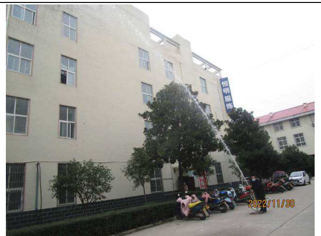
Fire hydrant testing