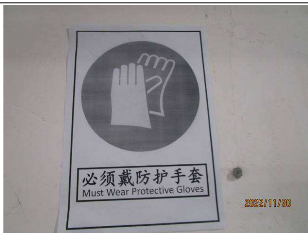
PPE warning sign