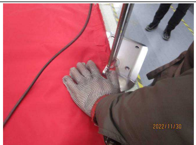
Metal glove for cutting worker