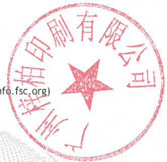
Nicolas MEY Signed on behalf of BVCH

Original certification date: 18-03-2014 Certification start date: 18-03-2024 Expiration date: 17-03-2029 FSC Certificate code: BV-COC-120234 Certificate No. / Version: CN047992/1 Contract No: 20688886 Issue date: 25-01-2024